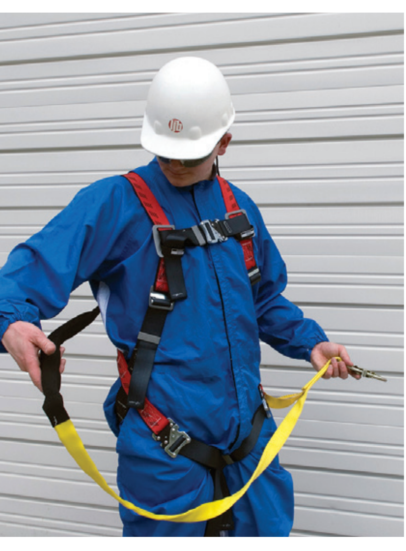
Well-planned and properly designed fall protection systems can only function if they are installed and used properly.